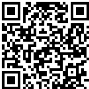
QR Code for the Giving Page

Every year our budget includes money to cover our congregation's share of the administrative costs of being a part of the Presbyterian Church (USA). An individual congregant's share is calculated on its total membership. This is called "Per Capita." This year the per capita is $37.18 per member, or $74.36 per couple. There is a blue Per Capita offering envelope located in your box of offering envelopes. The Per Capita assessment covers overhead cost of our Presbytery, Synod, and General Assembly. You can also make your Per Capita payment through our web page utilizing the Online Giving feature at www.fpcgh.org/donate or use the QR code.