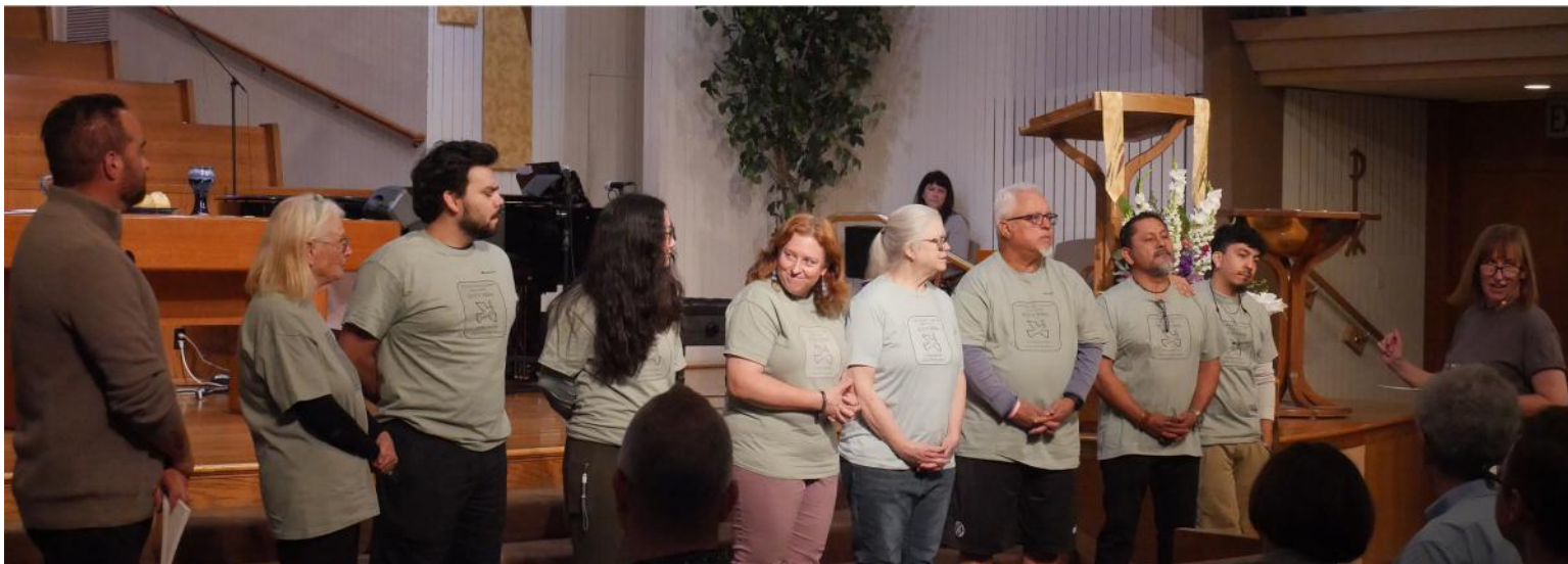
Picture: Commissioning our Mexico Missionary Team